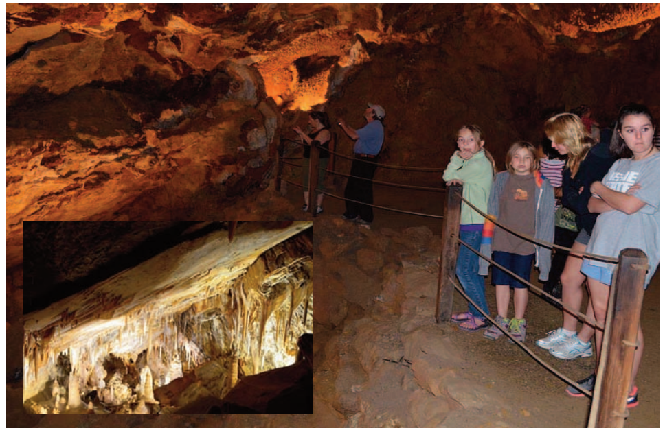
Above: Visitors enjoying the better lighting in the "barn." Inset: The formations known as "Kings Row."